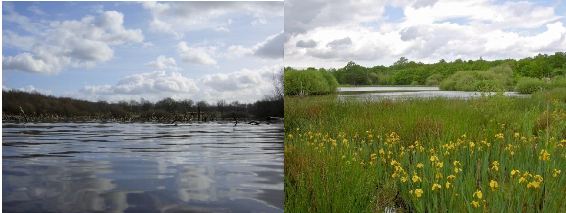
Views of Great Pond today