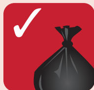
Carrier and bin bags