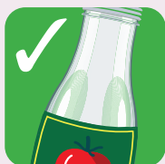
Glass bottles and jars