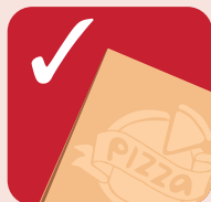
Greasy pizza boxes