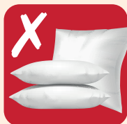
Pillows and duvets

Remember – Items must be clean, dry and placed in a tied, clearly labelled bag next to your bin.