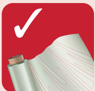
Plastic film and film lids