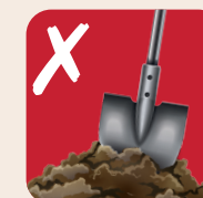
Soil and stones

Remember – Subscribe to the collection service – details online. Garden waste can be composted at home – order a discounted compost bin online at surreyep.org.uk