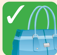
Bags and belts