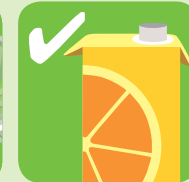
Food and drinks cartons