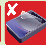
Plastic film and film lids