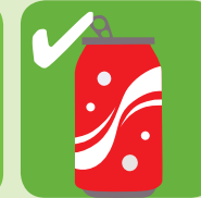
Food and drinks cans