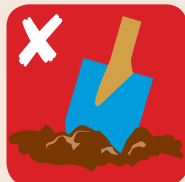
Soil and stones

Subscribe to our popular garden waste service at epsom-ewell.gov.uk/gardenwaste