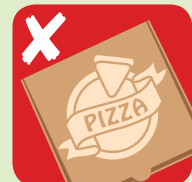
Greasy pizza boxes