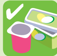
Plastic pots and tubs