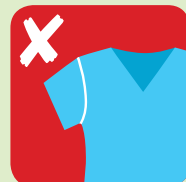
Clothing and textiles