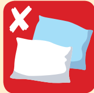
Pillows and duvets

Remember – Please put textiles, clothes, shoes and accessories in a sealed, clearly labelled bag by the side of your bin.