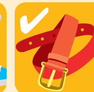
Bags and belts