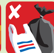
Carrier and bin bags