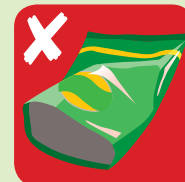
Plastic bags & food pouches