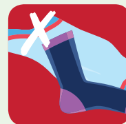
Clothes and textiles