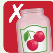
Glass bottles and jars