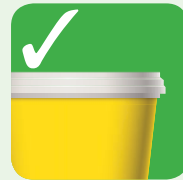
Plastic pots tubs and trays