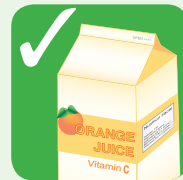
Food and drinks cartons