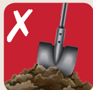
Soil and stones

Remember - Subscribe to the collection service – details online. Garden waste can be composted at home - order a discounted compost bin online at recycleforsurrey.org.uk .