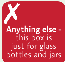
Anything else - this box is just for glass bottles and jars