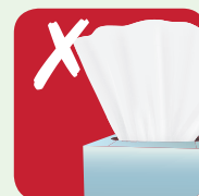
Tissues and wipes