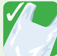
Empty plastic bags