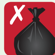
Black bin bags