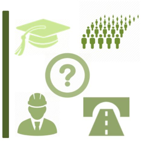
Ability to build 4,400 homes with the necessary infrastructure is unknown