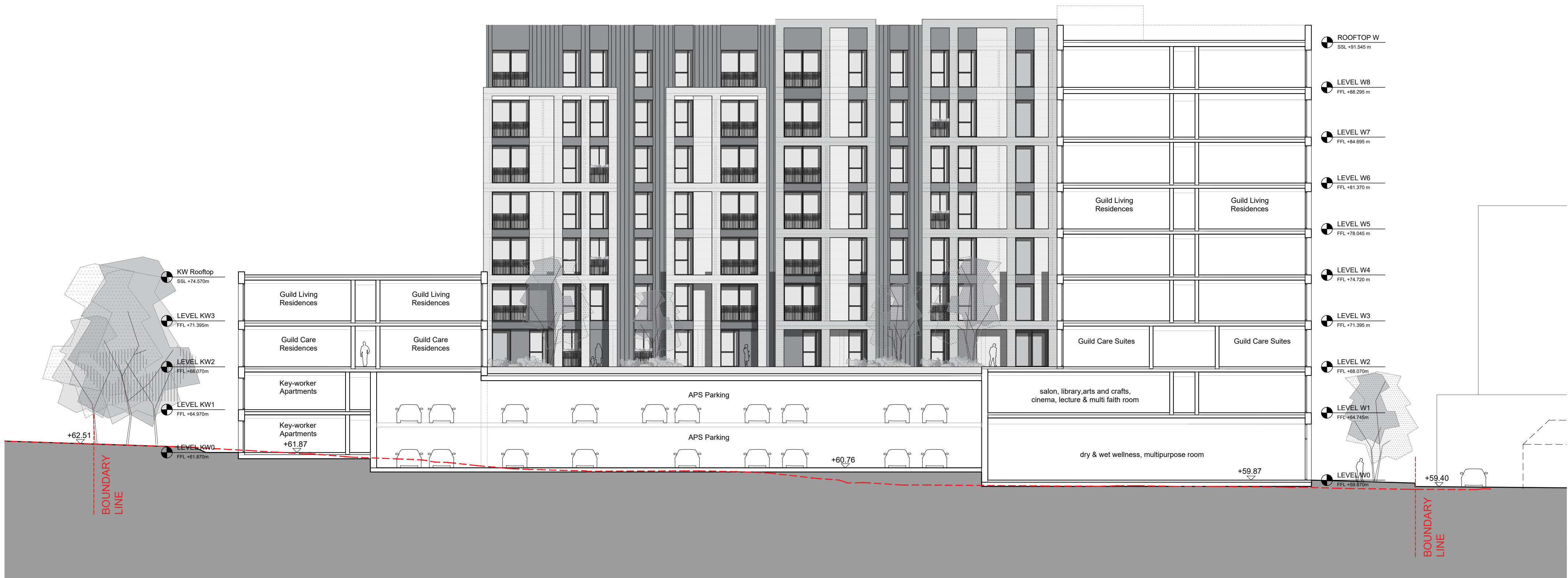
BUILDING SECTION EE'