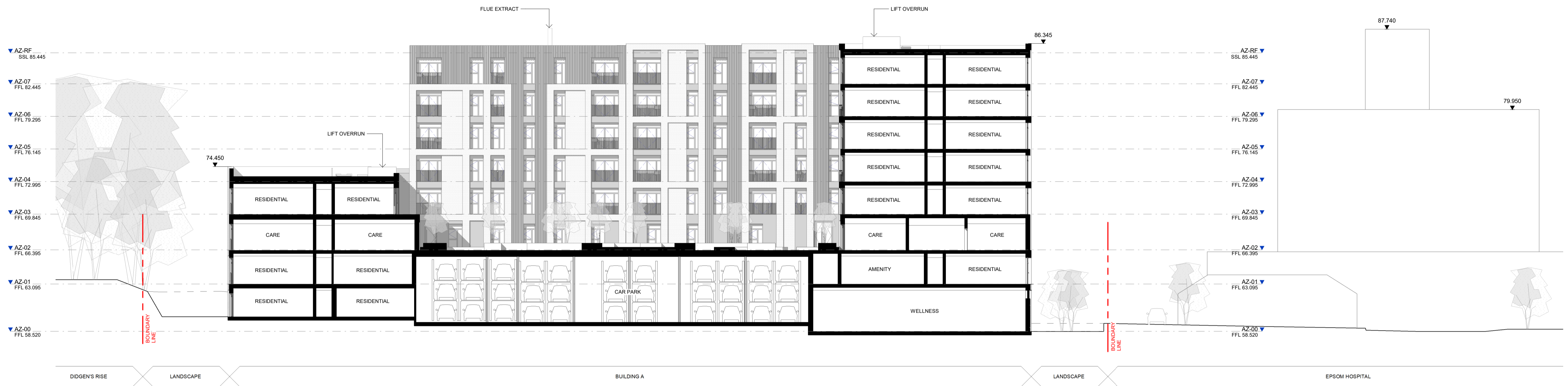
SITE SECTION EE 1 : 200

DATE: 04/02/2021 16:18:45 FILE LOCATION: BIM 360://18120 - Epsom/EP001-MPI-ZZ-M5-A-00002_PLANNING/JAN2021.rvt