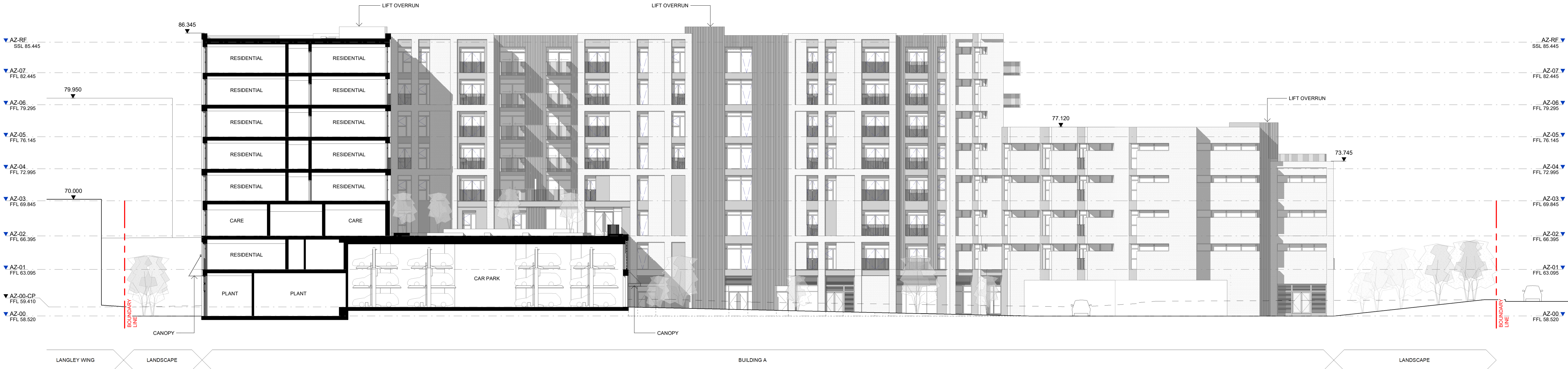
SITE SECTION CC 1 : 200

ISO A1 594mm x 841mm DATE: 04/02/2021 16:18:45 FILE LOCATION: BIM 360://18120 - Epsom\EPS001-MPI-ZZ-MB-A-00002_PLANNING\JAN2021.rvt