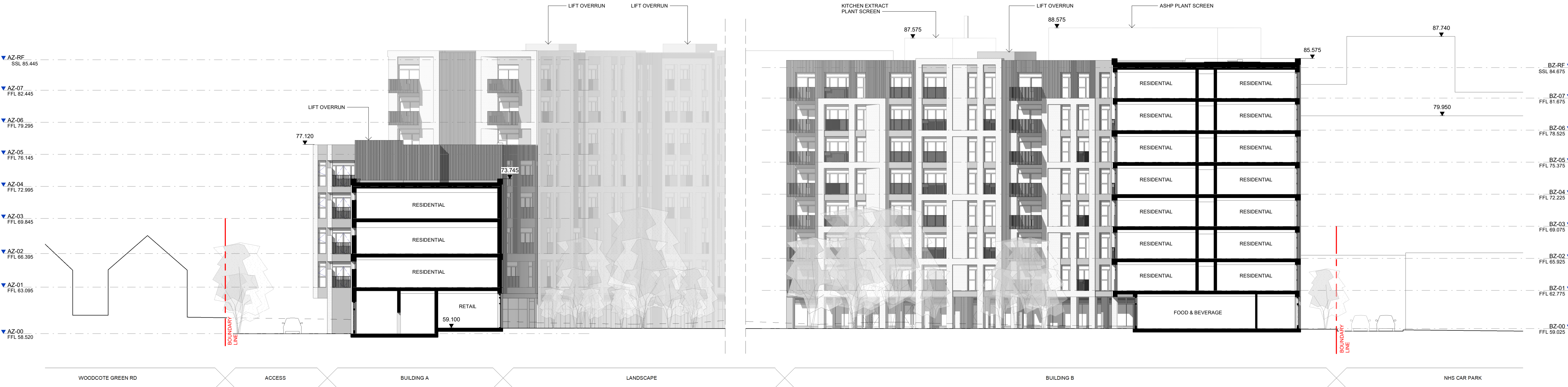
SITE SECTION DD 1 : 200