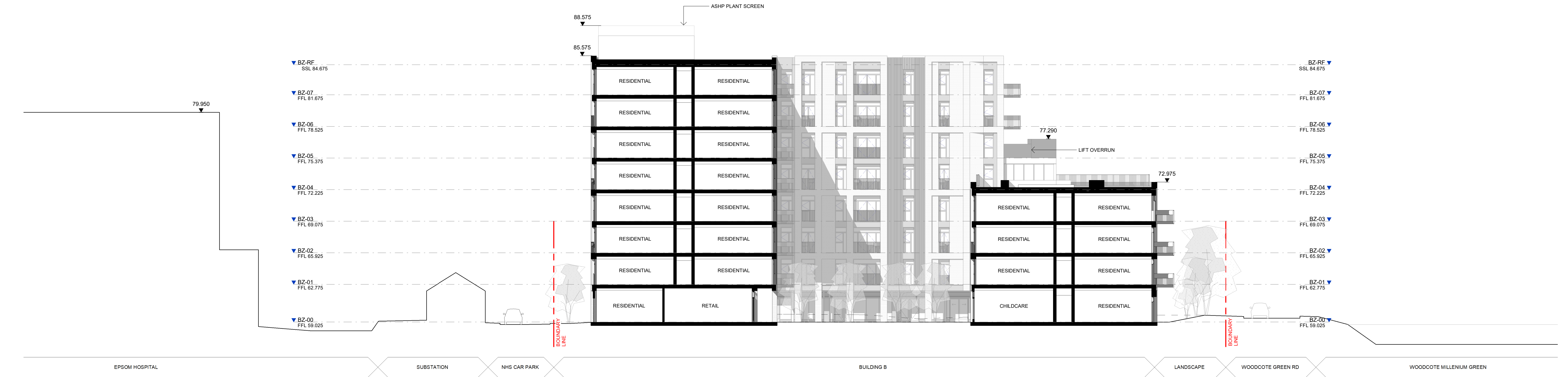
SITE SECTION BB 1 : 200

FACADE WIP WINDOW LOCATION FOR INFORMATION ONLY INDICATIVE LANDSCAPE