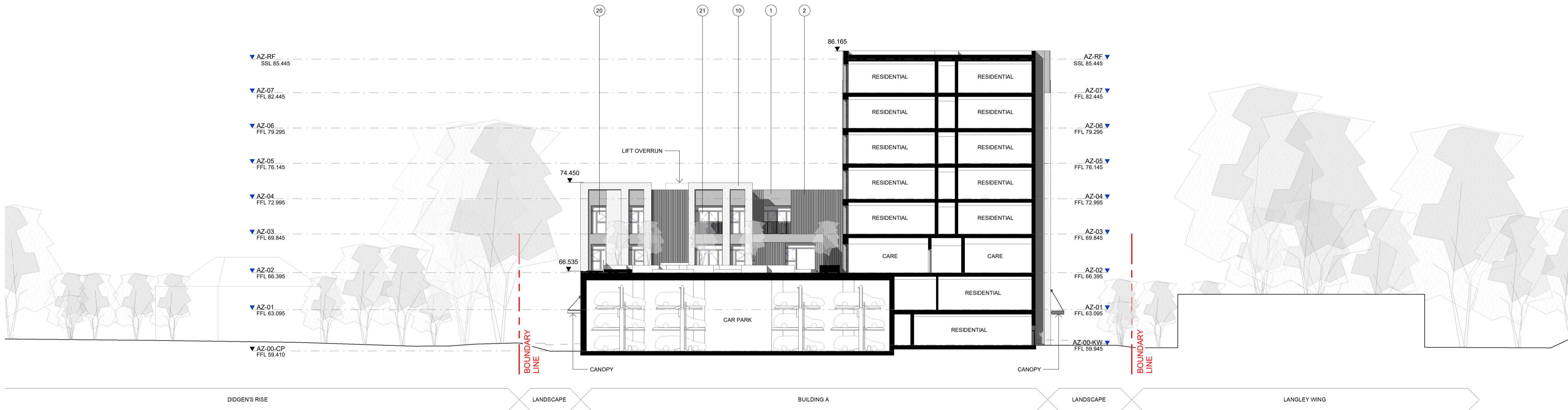
ELEVATION 13-13 - BUILDING A PODIUM EAST 1 : 200

ISO A1 594mm x 841mm DATE: 04/02/2021 16:27:25 FILE LOCATION: BIM 360://18120 - Epsom\EPS001-MPI-ZZ-M5-A-00002_PLANNING\JAN2021.rvt