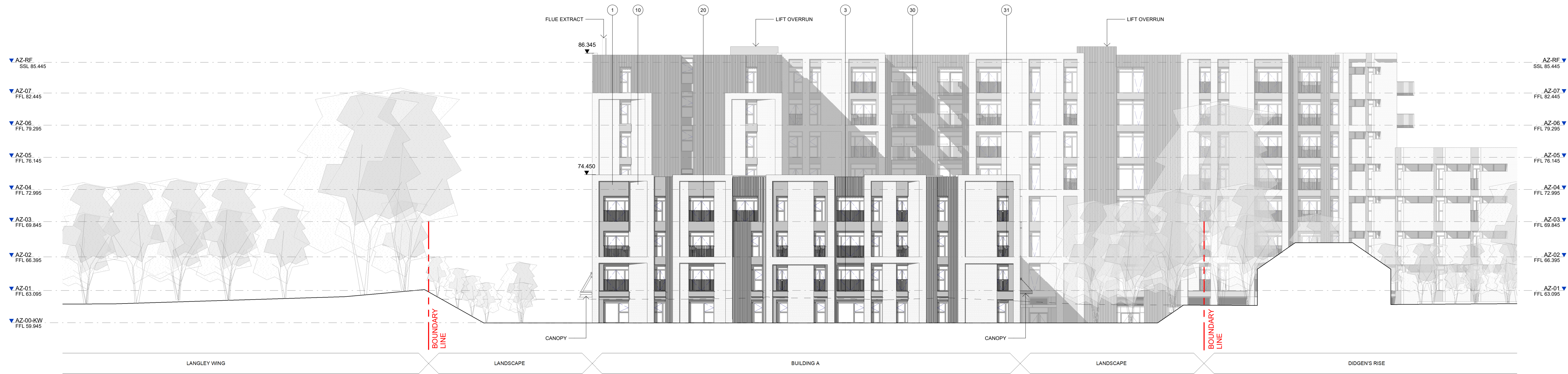
ELEVATION 12-12 - BUILDING A WEST 1 : 200

FACADE WIP WINDOW LOCATION FOR INFORMATION ONLY