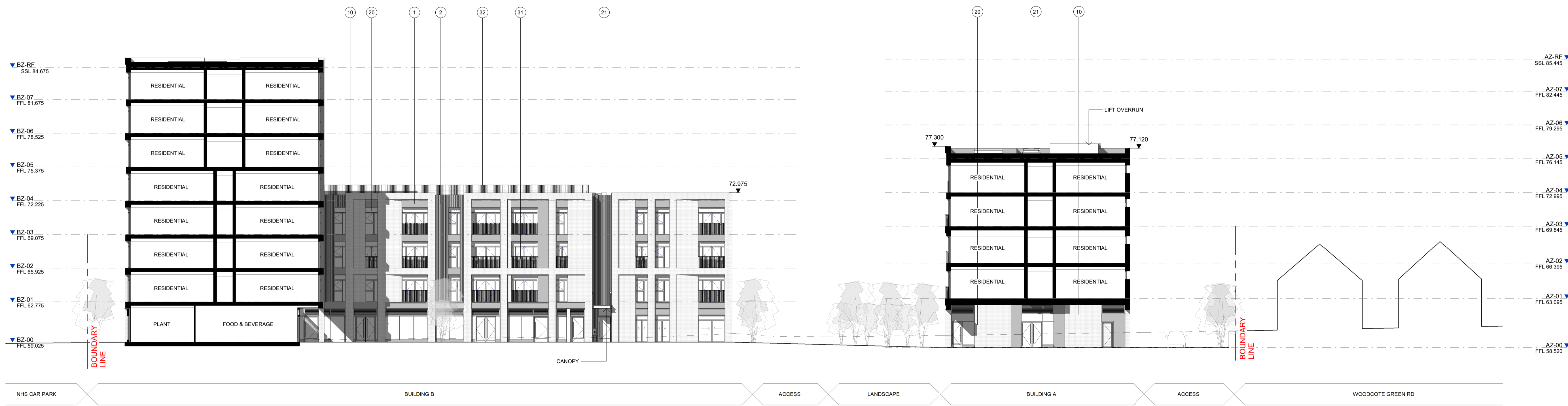
ELEVATION 10-10 - BUILDING B COURTYARD NORTH