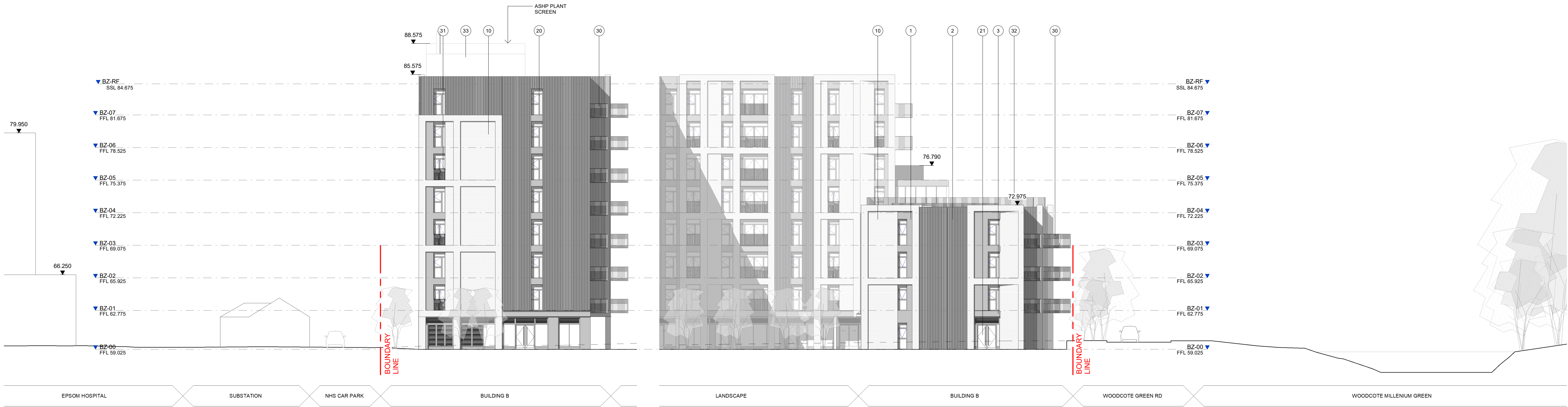
ELEVATION 9-9 - BUILDING B WEST 1 : 200

ISO A1 594mm x 841mm DATE: 04/02/2021 16:26:33 FILE LOCATION: BIM 360://18120 - Epsom\EPS001-MPI-ZZ-M3-A-000002_PLANNING\JAN2021.rvt