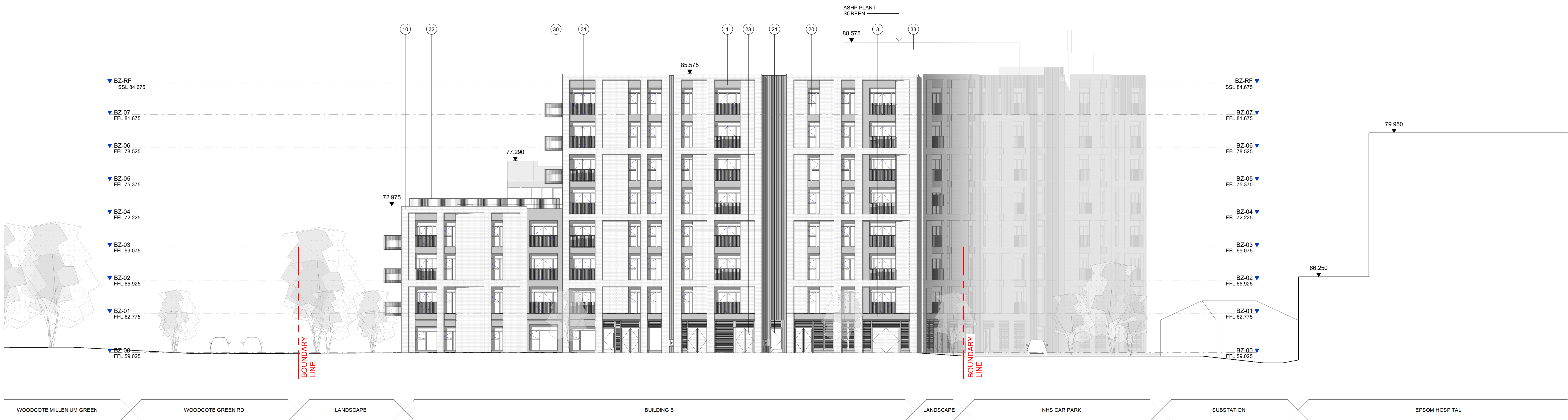
ELEVATION 8-8 BUILDING B EAST 1 : 200