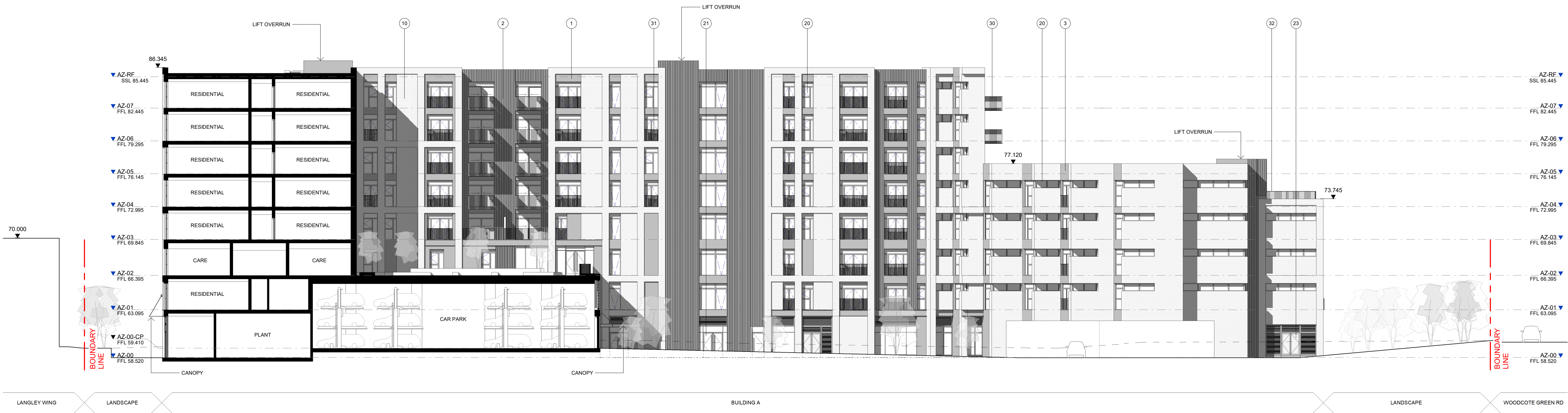
ELEVATION 4-4 - BUILDING A WEST 1 : 200