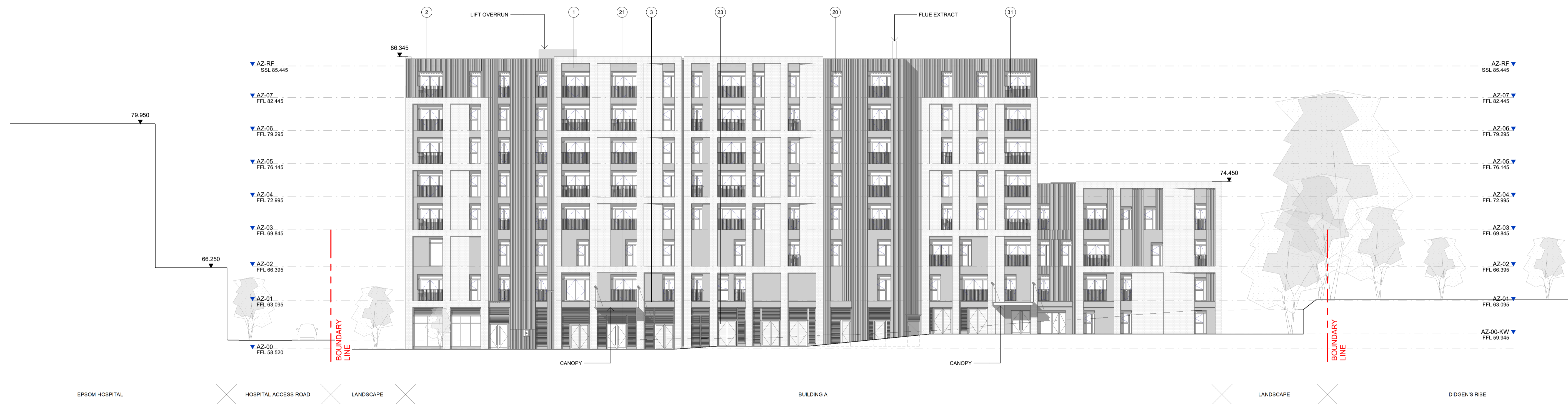
ELEVATION 3-3 - BUILDING A NORTH 1 : 200

DATE: 04/02/2024 16:22:34 FILE LOCATION: BIM 360://18120 - Epsom/EPS001-MPI-ZZ-M5-A-00002_PLANNING/JAN2021.rvt