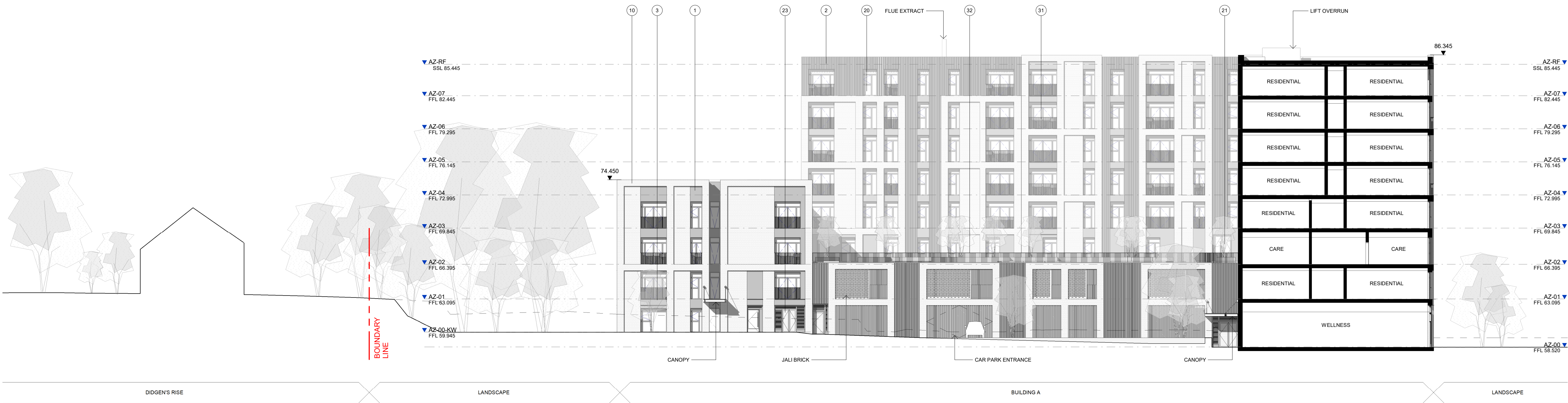
ELEVATION 1A-1A - BUILDING A SOUTH