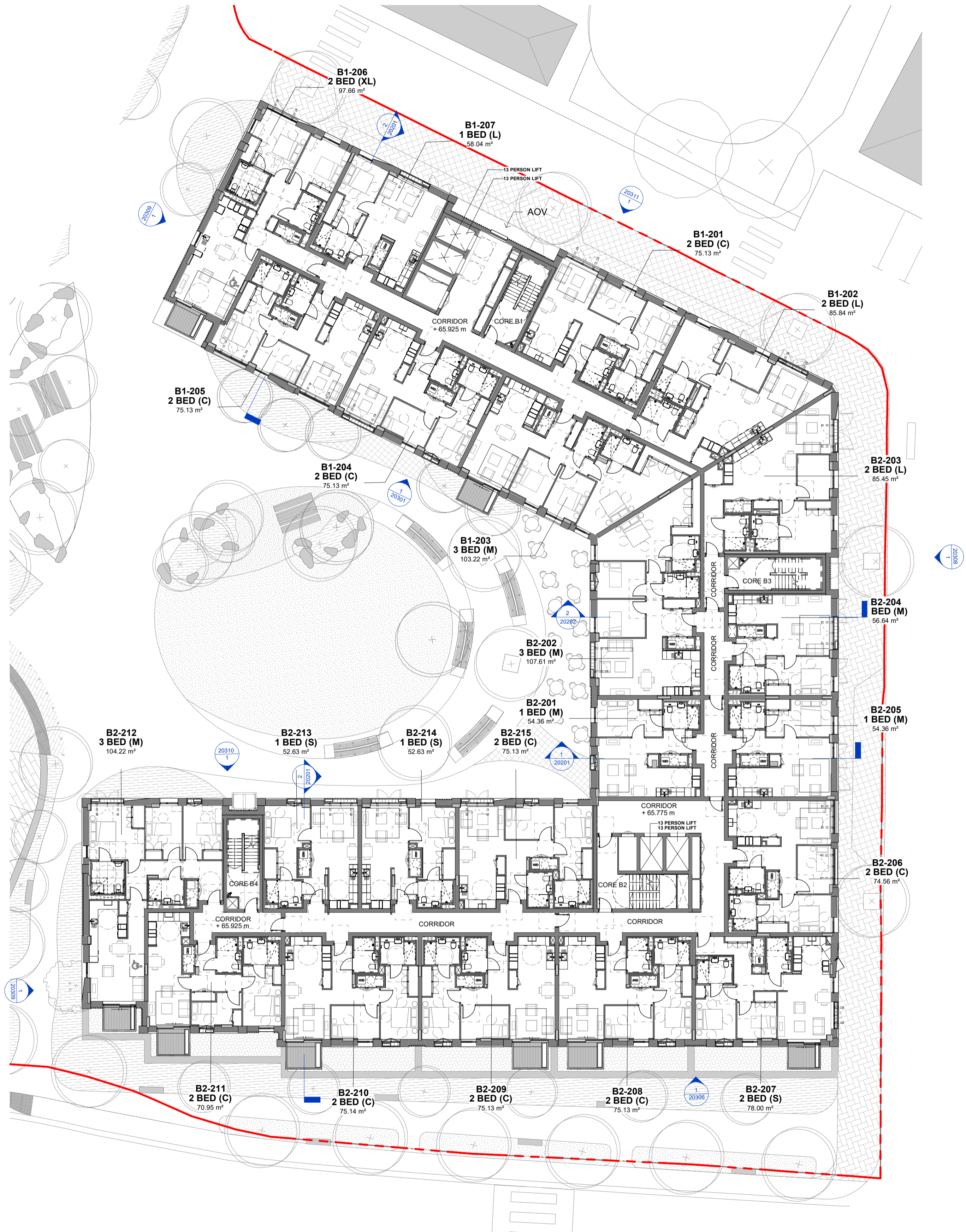
1 BUILDING B - L02 1 : 200