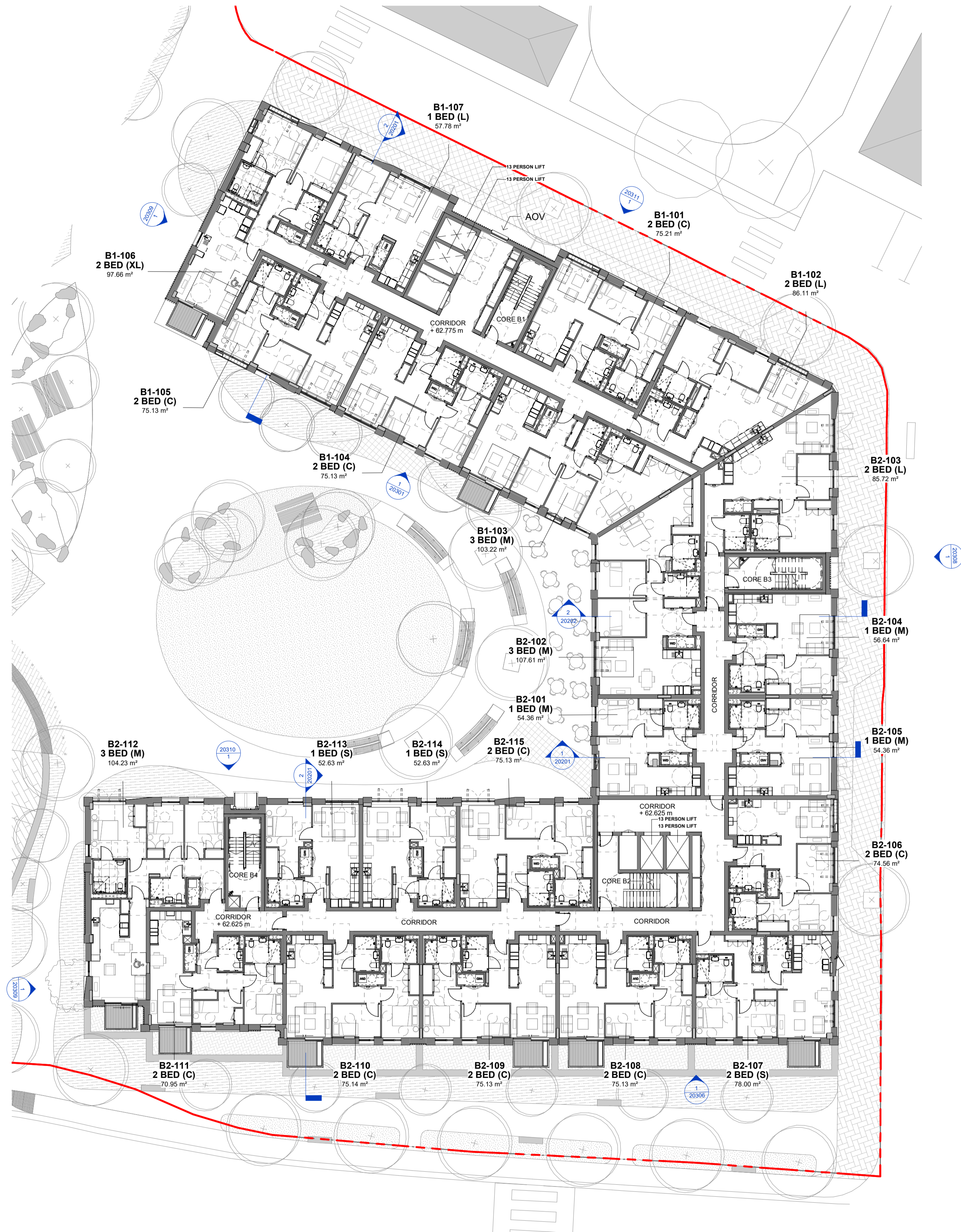
1 BUILDING B - L01 1 : 200