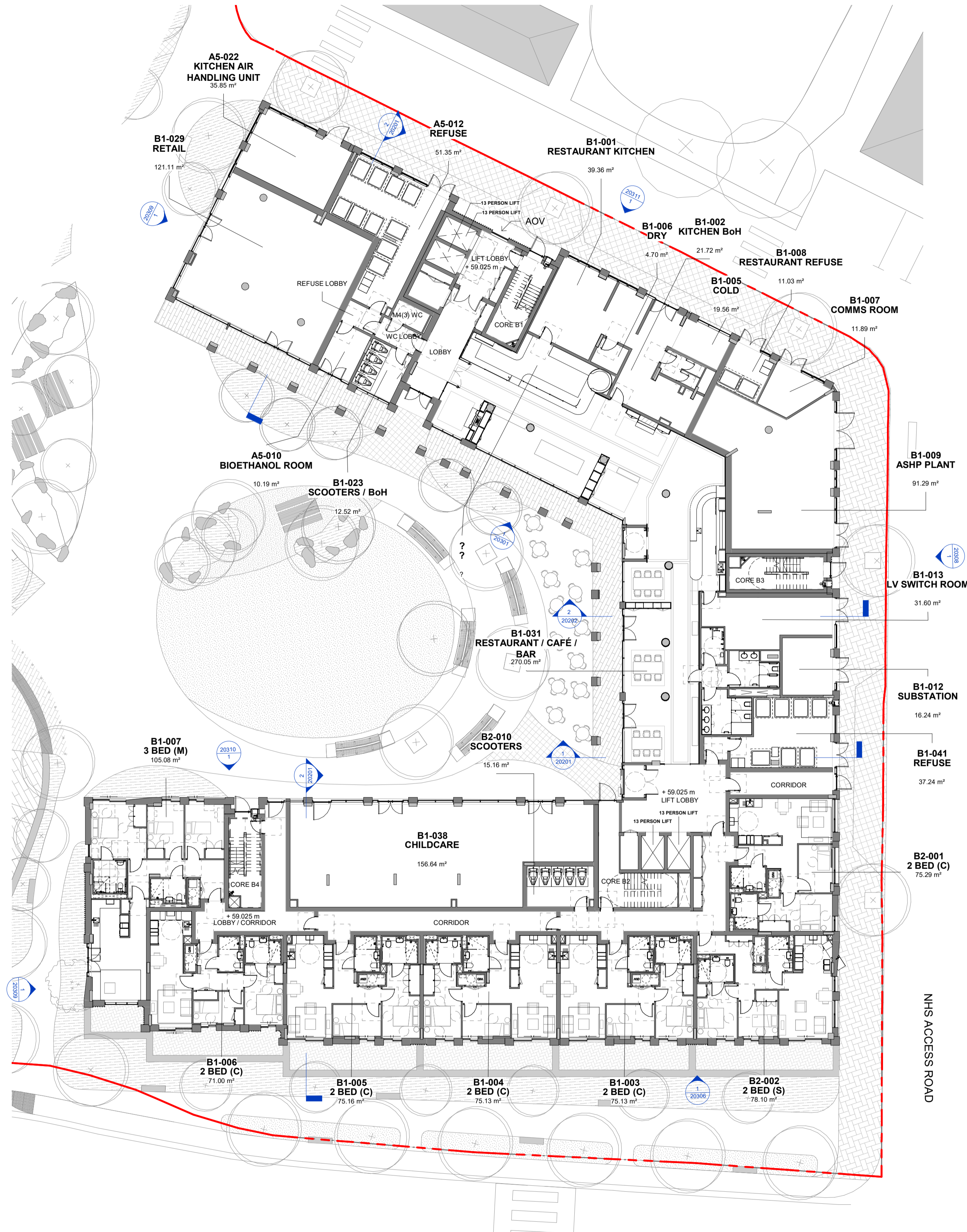
1 BUILDING B - L00 1 : 200