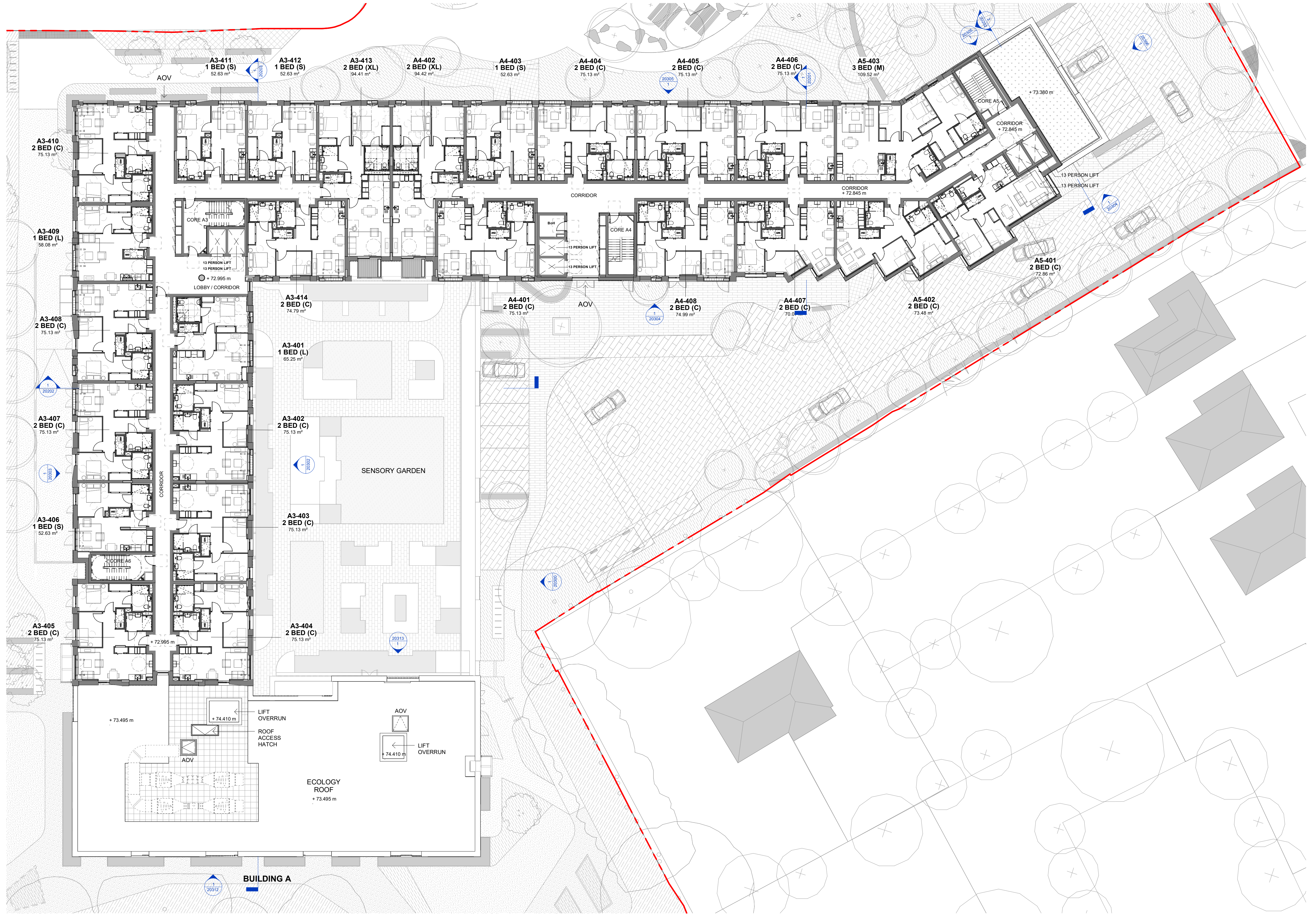
1 BUILDING A - L04 1 : 200