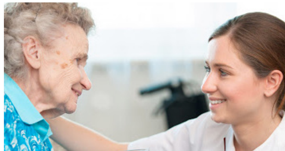
Care & Security