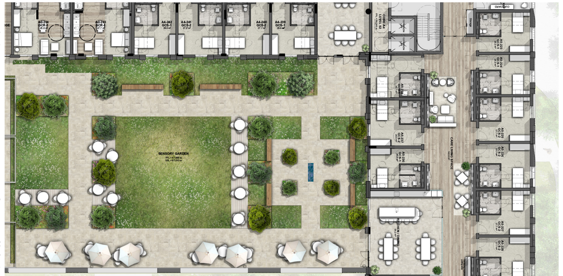
Care Floor Outdoor Amenity

The Guild Shield programme is led by academic expertise and the latest approach to biosecurity technology that will provide private testing to all those at risk to safeguard regarding containment. Early indicators and key vital signs are incorporated into our health applications to ensure those using the technology will be alerted.