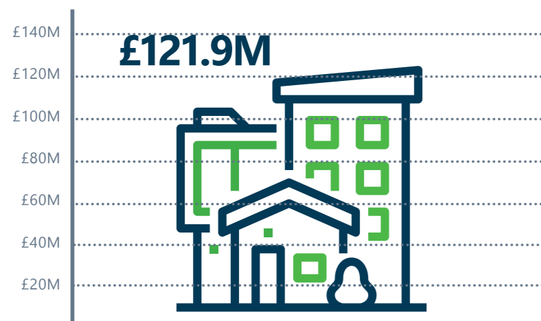
Estimated total cost of construction – £121.9M

A major construction project over 45-months, creating and sustaining a total of 793 job years of employment for local people, contractors and suppliers.