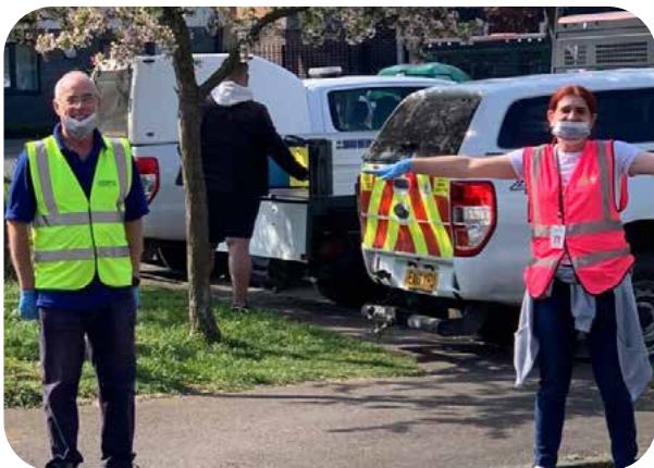
Delivery drivers practice safe distancing