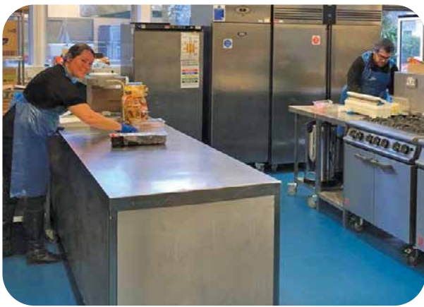
Working in one of the kitchens

There was a need for additional staff to prepare food and deliver it. Staff were drafted in to help from all areas of the council, and with the help of volunteers we were able to increase capacity and can now cater for an even greater demand should the need arise.