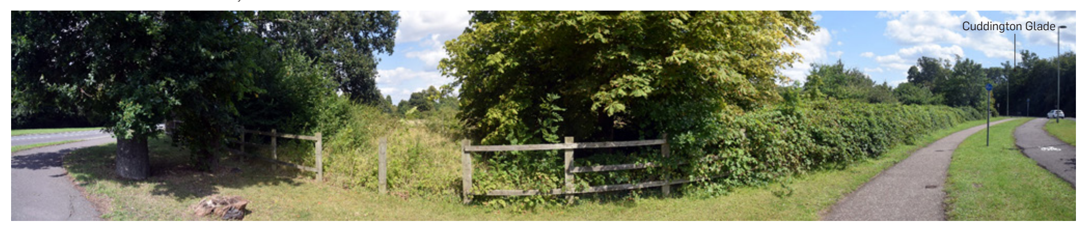
View 22-D View of the northern boundary with housing set back behind a well-vegetated boundary