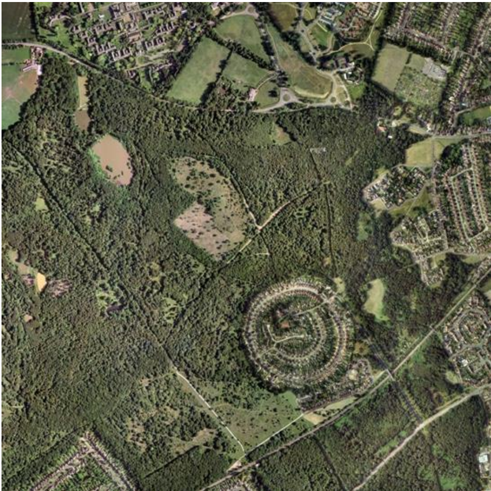
2003 - open areas of habitat are reinstated through the grazing project