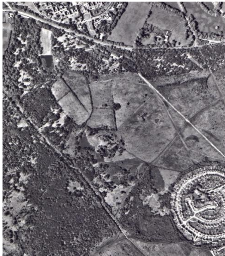
1971 - the Common remains relatively open