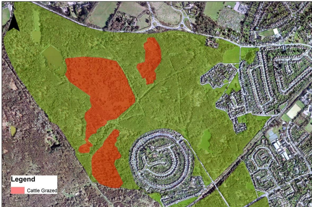
Area grazed by cattle in 2016