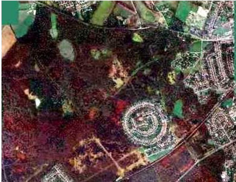
1998 - the open areas have been almost entirely encroached by developing woodland